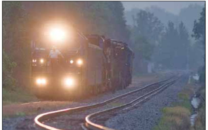
The crew is ready to tie for the night on the house track in Earlington, just a few miles south of Madisonville.