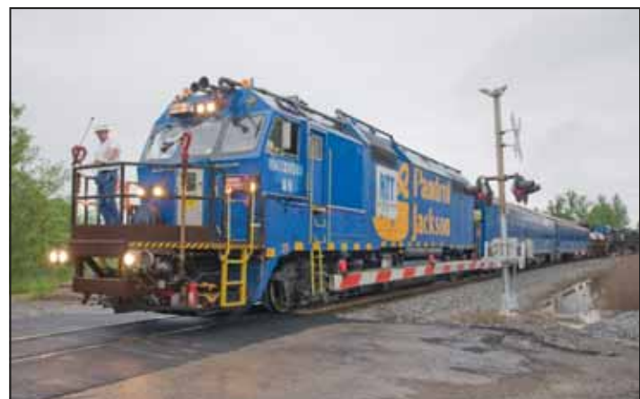
The grinder is passing over W Broadway, Madisonville, where new gates and bell have just been installed.