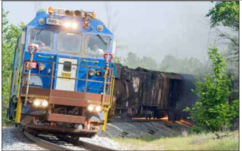
A Pandrol Jackson Railgrinder RMS-5 works its way south through the curve approaching the haul road outside of Earlington Wednesday morning May 28, 2008 on CSX's Henderson Subdivision as it works between Madisonville's Trident and Mortons Junction. According the crew CSX tries to resurface the rails twice a year to improve performance and life of the rail.